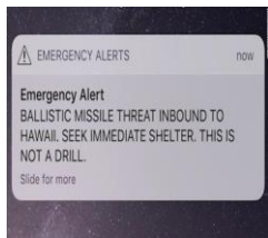
The Missile Alert that Reached Most Phones on the Hawaiian Islands

Assessment: Like the Cleveland captives (2013), the emancipation was accomplished through notification from one of the imprisoned, rather than any discovery from an outsider. Torture victims have been revealed during emergency responses, but many times it is too late. Suspicious activity reporting to, and by, responders can be a vital component of saving such victims. In this case, the couple had no prior contact with police. A Riverside County Sheriff’s captain further testified that the mother seemed “perplexed as to why we were at the residence,” indicating a level of denial that may help to mask the crimes. January 11 th was #WearBlueDay, sponsored by the DHS Blue Campaign to end human trafficking, whose indicators cross with the California case.