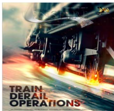
Cover Photo of Inspire No. 17

Assessment: Though he wanted to send a message to the government “that says, ‘You are a target,’” the plot widely diverged from McVeigh’s bombing in intended casualty count. It was reported that he was originally “out for blood,” but had a change of heart and decided to minimize casualties (similar to the bomb-diffusing scene in Fight Club ). “Three Perceners,” who were counted among attendees at the “Unite the Right” rally in Charlottesville, are a group whose name derives from a belief that only three percent of the American colonies’ population participated militarily in the War of Independence. They believe that, as patriots, they must protect against a tyrannical government, particularly regarding infringement on Second Amendment rights.