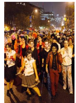
Greenwich Village Halloween Revelers