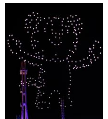
300 Drones Form White Tiger in Sky to Close Olympic Games in PyeongChang

With Tomorrow's AI, More than Your Job Could Be Terminated – Oracles of technology, whether it be business leaders, academics or science fiction writers have warned of the rise of killer bots for decades, and a recent report from the EFF, a venture among several U.K. universities and groups, predicts that tomorrow's artificial intelligence will be superior to humans in many ways, and will even show a certain insensitivity (AI emotions are another conversation). Future virtual life could be weaponized through many means, such as with UAVs or other vehicle platforms, and it could even engineer deadly viruses against humans.